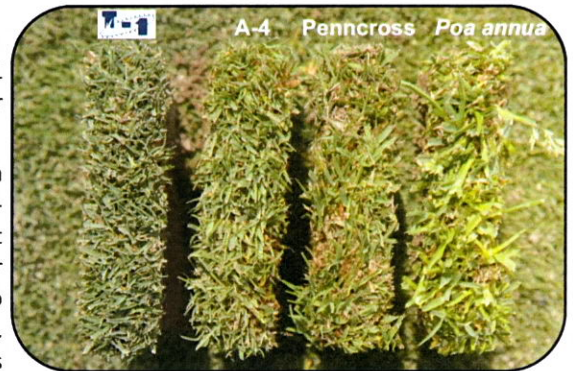
T-1 stands apart in color, leaf texture and density