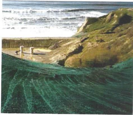
Less expensive than extended term blankets, and less soil preparation is required