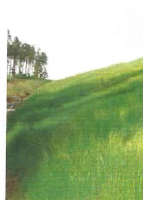
Effective immediately and grass grows twice as fast as blankets