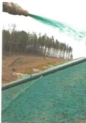
Same speed and cost-savings of other hydraulic applications, but lasts twice as long